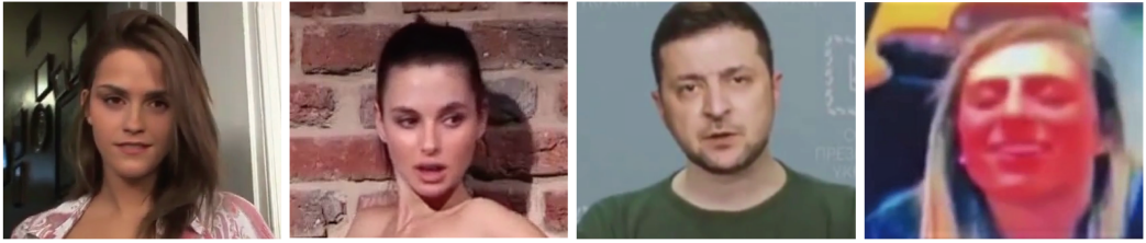
Fig. 2. Screenshots of the four real-life Deepfake videos for Deepfake detection in the case study. The videos are hyper-realistic with different resolutions and no obvious artifacts can be observed visually by human eyes.

fake faces. Regarding the AUC scores, ignoring the imperceptible differences and taking a look at Table 6, 76.64% is derived by Xception because of its ability to separate real and fake samples at a certain threshold even though performing relatively unsatisfactory with the threshold value of 0.5 regarding the softmax output scores. Besides, MAT [192] is the only other model that has achieved above 70% AUC score. In the remaining approaches, RECCE has reached above 65% AUC scores, while the other two methods have performed relatively unsatisfactory in comparison.